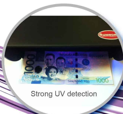
Strong UV detection